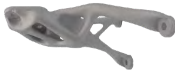
A6061-RAM2 bracket